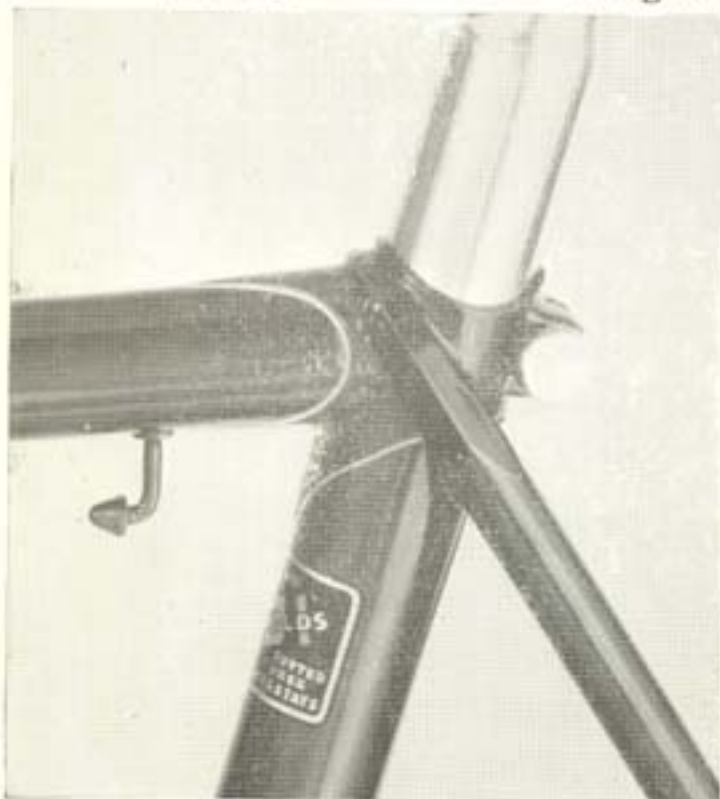
Wrapover Seat Stays