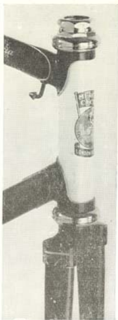
King of Mercia