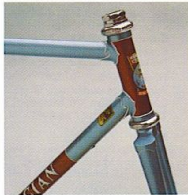
Hand cut Superlight lugs.