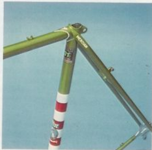
Mercian engraved seat stays on King of Mercia.