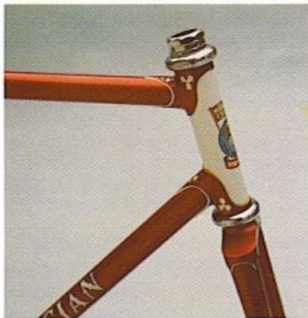
Clover leaf cutouts on the Strada Speciale.

Reynolds New "Professional" Tubing with double taper seat stays and also Reynolds "Special Lightweight" Tubing can be used at extra cost.