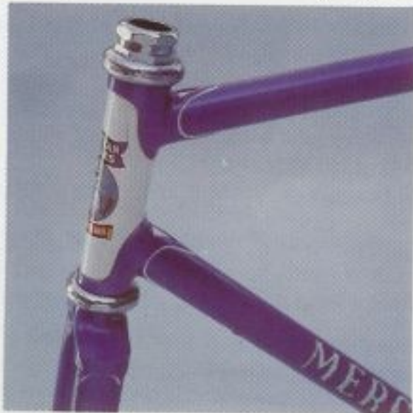
Heart cutout lugs and Romani crown on King of Mercia

(alloy carrier and bottle cage optional extras).